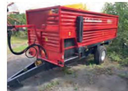
2017 Schuitemaker Feedo 50.8 Feeder Wagon, variable floor speed, beaters & cross conveyor £14,000 BW