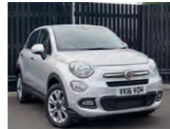
2016 Fiat 500X 1.6 MultiJet Pop Star, VX16 VOH, Grey, 7,325 miles, £11,950. Auto Climate Control, Cruise, Start/Stop, DAB Audio, 17in Alloy Wheels, Rear Parking Sensor, Hill Holder.