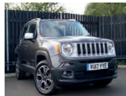
2017 Jeep Renegade 2.0 MultiJet II Limited, VU17 YYE, Granite Crystal, 6,500 miles, £23,950. 8-Way Power Seats, MySky Open Air Roof, Function Pack, Parking Pack, Heated Front Seats, DAB.