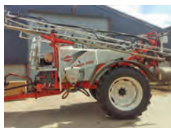
2012 Kuhn Trailed Sprayer, 3200 RHPA, 24 mtr booms alloy, 2800 ltr, auto steer drawbar £18,000 SC