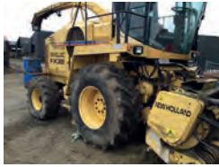
2000 New Holland FX38, 3317 cutting hrs, 4650 engine hrs, crop processor £22,000 RM