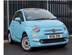
2016 Fiat 500C 1.2 Lounge, WX16 XSH, Blue, 8,608 miles, £9,950. Leather Interior, 5in Touchscreen, Satnav, Air Conditioning, Front Seats with Memory, Start/Stop, Rear Parking Sensors, Hill Holder.