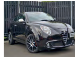
2014 Alfa Romeo MiTo 0.9 TB TwinAir Sportiva, VN64 UJC, Black, 19,575 miles, £8,450. Climate Control, Cruise, Radio/CD/MP3, Bluetooth, 18in Alloys, Tinted Glass, Electric Windows, Alarm.