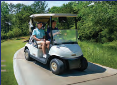
Revolutionary golf car with lithium technology