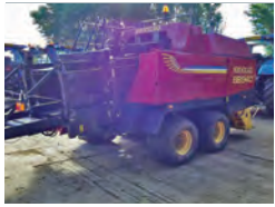
2002 New Holland BB940 Big Baler, 92000 Bales, good condition for age £17,500 AT