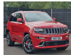
2017 Jeep Grand Cherokee 6.4 Hemi SRT, VE17 OXL, Red, 1,200 miles only, £50,995. £19,000 Saving! Nappa Leather & Suede Heated Ventilated Seats, Rain Sensor, Rear View Camera, Alarm.