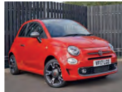
2017 Fiat 500C 1.2 S, VF17 LGD, Red, 20 miles only, £13,650. Pre-Reg - Save £3,140! 16in Alloys, 7in TFT Screen, Air Conditioning, Cruise, Start/Stop, Rear Parking Sensors, Dark Tinted Glass, TPMS.