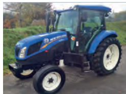
2016 New Holland TD5.95, 2wd, 12 x 12 powershuttle, 1549 hrs, good condition £14,500 BW