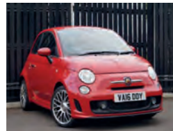
2016 Abarth 595 1.4 T-Jet, VA16 DDY, Red, 8,100 miles, £10,950. Air Conditioning, Electric Front Windows, Blue&Me - Bluetooth, Tinted Glass, Radio/CD/MP3, TPMS, Full Dealer Service History.