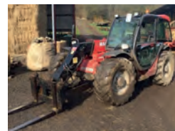
2011 Manitou MLT 634T, 120 LSU PS, pin & cone, excellent condition £31,000 JW