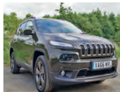
2017 Jeep Cherokee 2.2 MultiJet II, VA66 MVL, Recon Green, 9,000 miles, £26,995. 75th Anniversary Model, Panoramic Sunroof, Park Assist, Morocco Nappa Leather, Auto Aircon, Rain Sensor, Alarm.