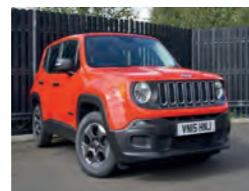
2015 Jeep Renegade 1.6 MultiJet Sport, VN15 HNJ, Pastel Red, 28,098 miles, £10,429. Air Conditioning, Power Windows, DAB Audio, Stop/Start, Hill Start Assist, 16in Alloys, Premium Alarm.