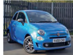
2017 Fiat 500 1.2 S, VA66 CHO, Blue, 4,625 miles, £9,650. Air Conditioning, Start/Stop, Rear Parking Sensors, Cruise, Front Seats with Memory, Electric Windows, Hill Holder, Start/Stop, Parking Sensors.