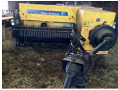
New Holland BC5060 Baler, like new only done small amount of work £10,200 RM