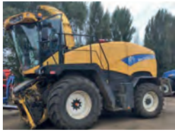
2010 New Holland FR9060, 4wd, grass & maize £78,500 AT