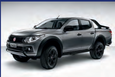
Fiat Fullback Cross: rugged lifestyle pickup