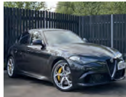
2017 Alfa Romeo Giulia 2.9 Biturbo V6 Quadrifoglio, VE17 FYY, Black, 2,650 miles, £57,450. 510 bhp, Leather/Alcantara, Harman Kardon, 5-Hole Alloys, Yellow Callipers, Climate Control.