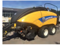
2016 New Holland BB1290 standard Big Baler, steering axle, extended warranty, 14000 bales £72,000 BW