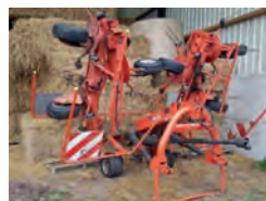
2013, Kuhn GF7902 Mounted Tedder, 7.8m 8 hyd folding rotors £7,000 BW