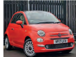
2017 Fiat 500 1.2 Lounge, VF17 LFX, Coral, 30 miles only, £10,900. Air Conditioning, Front Seats with Memory, Fixed Glass Sunroof with Blind, Electric Windows, Hill Holder, Start/Stop, Parking Sensors.