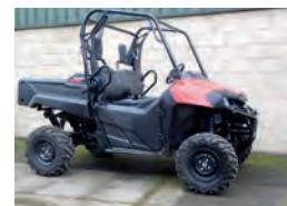
EX-DEMO - 2017 Honda UTV 700M2, 2/4wd and difflock, 2 year warranty, fitted towball, £10,250 TR

Sales Hotline: 01373 465941 (Mon-Fri 08.00-17.00) Out of hours: 07710 985957