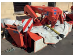
2015 Kuhn FC313DF, front mounted 8 disc cutterbar, 3.1m cut, steel condition, fast fit blades £7,800 BW