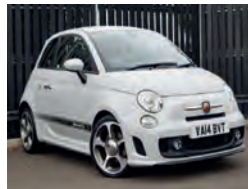
2014 Abarth 500 1.4 T-Jet MTA Auto, VA14 BVT, Grey, 7,600 miles, £10,450. Climate control, 5-spoke Abarth Alloy Wheels, Electric Front Windows, Hill Holder, Radio/CD/MP3.