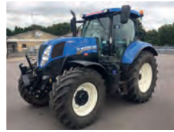
2013 New Holland T7.200 Auto Command, sidewinder, front linkage, 2300 hrs £55,000 BW