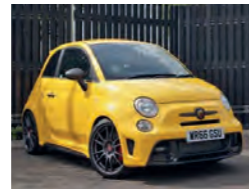
2016 Abarth 695 1.4 T-Jet Biposto Record, VR66 GSU, Yellow, 136 miles only, £24,450. Leather and Alcantara Upholstery, Tinted Windows, Sabell Carbon Shell Seats, 18in lightened O.Z. Alloys.