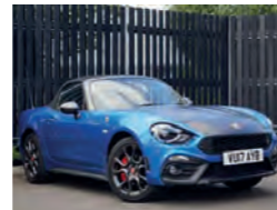
2017 Abarth 124 Spider Roadster 1.4 MultiAir, VU17 AYB, Blue, 2,000 miles, £26,950. Ex-Demo, Bose Audio, Visibility Pack, Abarth Leather, Heated Seats, Air Conditioning, 17in Alloys, Alarm.