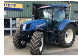
2014 New Holland T6.175, c/w front & cab suspension, 50k with air, Michelin tyres, 2401 hrs £38,500 MH