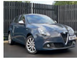
2017 Alfa Romeo Giulietta 1.6 JTDM-2 Super, VU17 AYJ, Grey, 7,500 miles, £17,495. Red Leather, Visibility Pack, Dark Tinted Windows, Comfort Pack, Aluminium Pedals, Turbine Alloys.