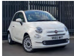
2015 Fiat 500 1.2 Lounge, VK65 WHT, White, 29,700 miles, £6,950. Fixed Glass Sunroof with Sunblind, 5in Touchscreen, Satnav, Electric Front Windows, Rear Parking Sensors, 15in Alloys.