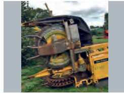
2004 New Holland 8 Row Maize Header, to fit New Holland FR. Very good condition £15,000 AT