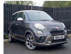
2014 Fiat 500L 1.6 MultiJet Trekking, WN14 LWU, Green, 27,200 miles, £8,450. Dark Tinted Windows, Air Conditioning, Rain Sensor, Cloth/Leather, 17in Alloys, 5in Touchscreen, Cruise, PDC.