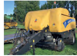
2011 New Holland BB9060 Packer Cutter Baler, 42000 bales, VGC £37,500 AT