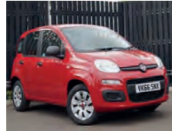
2016 Fiat Panda 1.2 Pop, VK66 SNX, Red, 2,000 miles, £5,950. Ex-Demonstrator, Start/Stop, Radio/CD/MP3, Hill Holder, Electric Front Windows, Anti Whiplash Head Restraints, TPMS.