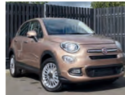
2017 Fiat 500X MultiJet Pop Star, Unreg, Bronze, 10 miles only, £19,450. Cancelled Order! Dual Zone Climate Control, Comfort Pack, Satnav, 5in Touchscreen, DAB Audio, Parking Sensors.