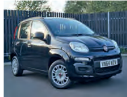
2014 Fiat Panda 1.2 Easy, VN64 WZV, Black, 26,000 miles, £4,950. Air Conditioning with Pollen Filter, Radio/CD/MP3, Electric Windows, One Owner, Full Service History.