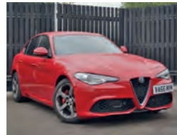
2017 Alfa Romeo Giulia 2.2 TD Speciale, VU17 AYF, Alfa Red, 8,000 miles, £30,595. Climate Pack, Convenience Pack, Driver Assistance Pack, Auto Air Conditioning, 6-Way Power Seats.