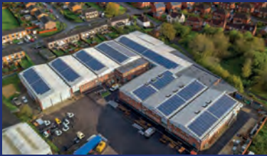
A fourth T H WHITE solar installation