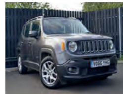
2016 Jeep Renegade 1.6 MultiJet II Longitude, VO66 YHG, Granite Crystal, 11,786 miles, £13,995. Ex-Demo, Air Conditioning, DAB, Cruise, DAB, Satnav, 17in Alloys, Power Windows, Start/Stop.