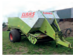
2002 Claas 2200 Big Square Baler, 120 x 70 bale, rotor feed, single axle, good working order £12,000 JW